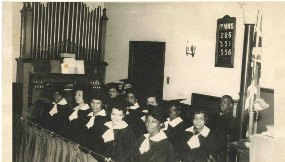
(Photo: The choir of Union United Church, Montreal, 1944; Union United Church archives)